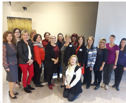
PCUH Ukrainian Language Assessment Symposium participants

Symposium participants identified an overarching need for a bank of skill descriptors, compiled from existing Ukrainian and English language portfolios. Plans are underway for a follow-up phase to the Ukrainian Language Assessment Symposium. A working group of representatives from the symposium will review and sort descriptors by age of learners and stages of language learning. The goal is to gather samples and create a bank of Ukrainian language assessment tools that can help teachers to identify student language levels along the CEFR scale.