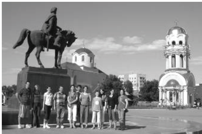
SSU 2006 students on a fieldtrip to the city of Halych.

Summer Semester in Ukraine took place May-July of 2006. It has been our fourth time traveling to Ukraine and the second year of collaborating with Ternopil National Pedagogical University. What was new in 2006?