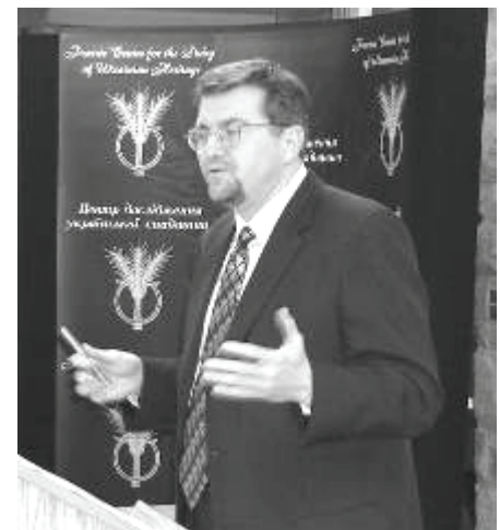
Dr. Plokhii delivers 2007 Mohyla Lecture

In the academic world and beyond, Dr. Plokhii is known for his numerous books dealing with the world of Slavic nations, Ukrainian history, Cossackdom, religion and society in Ukraine and the Russian Empire, which appear in the best publishing houses of the world.