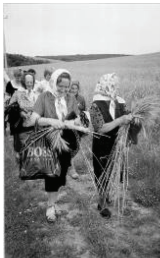
Blessing the fields.

kind, her photography speaks not only of Ukraine but of how much a young Canadian woman, who grew up across the ocean and generations apart from her ancestral kin, embraced the land and its people in discovery of her own self. Out of two thousand pictures she took with her cheap camera from Superstore, and developed in Ukraine (never mind the extra suitcase to travel with!), only twenty made it into the show. Yet, they are representative of Zaluski's take on Ukraine. Each image emanates much kindness which is certainly a projection of the photographer's attitude towards her subjects and her surroundings.