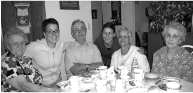
Oral history research is done not on people, but with people. Ituna 2002.