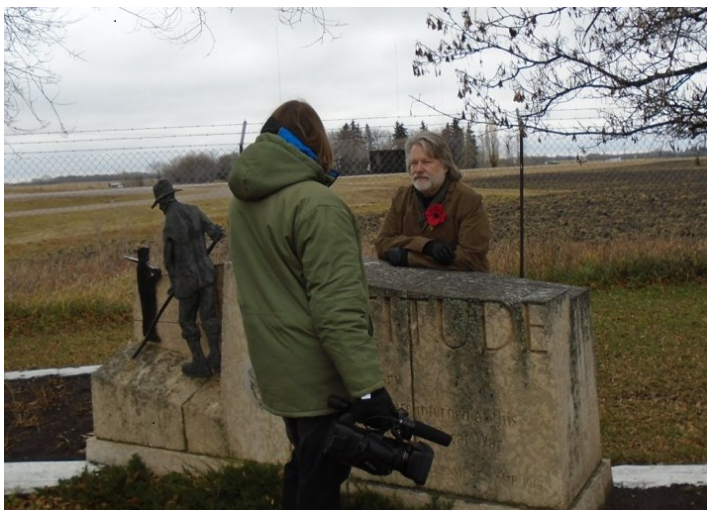
Filming at the Eaton Internment Heritage Site