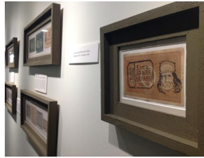
Ukrainian Currency Exhibit at the Galt Museum, Lethbridge, AB

been travelling since September 2013. The Alberta leg of the tour was organized and supported by the Alberta Society for the Advancement of Ukrainian Studies.