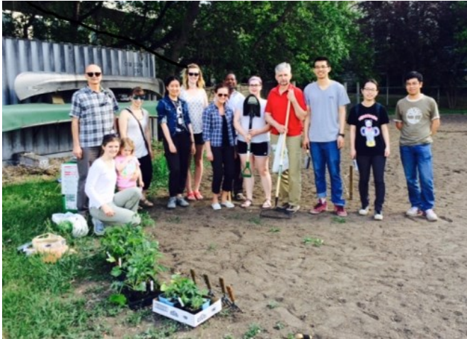
2015 Ukrainian Community Garden Participants

A student-centered 'Ukrainian' community garden at the University of Saskatchewan was launched with a planting event on June 6, 2015. In attendance were representatives of the Ukrainian Students' Association, the Sustainability Education and Research Institute, and the School of Environment and Sustainability Students' Association. The purpose of the project is not only to produce fresh and healthy food, but also to build a sense of community and enhance the student relationship with the environment via cross-departmental and cross-cultural connections. A particular focus was on traditional foods in a 'Ukrainian' garden.