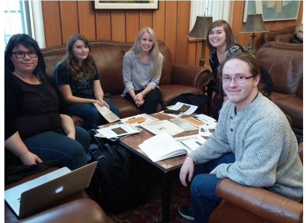
Students at Ukrainian Studies Reception

program, the Minor in Ukrainian Studies, scholarships and awards in Ukrainian Studies, the 'Spring Session in Ukraine' study-abroad program, and the activities of the University of Saskatchewan's Ukrainian Students' Association. A large number of students were in attendance this year, along with university faculty and community supporters.