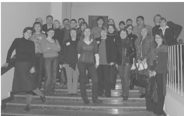
Conference participants in Kharkiv this past December — creating new networks and partnerships.

In Search of Voice: Oral History as Theory, Method and Source Kharkiv, December 11-12, 2009